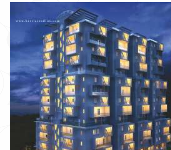
Jains Sadguru Heights, Madinaguda.