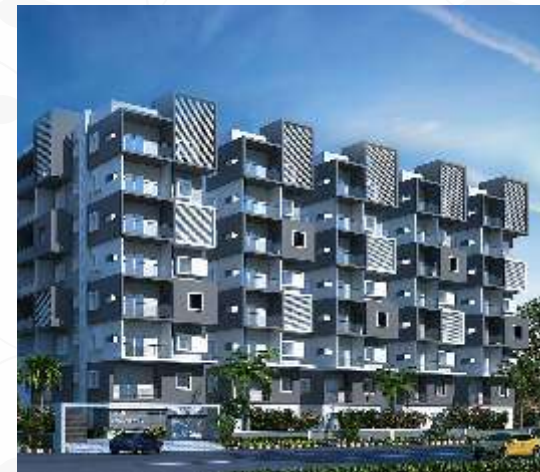
Jains Ravi-Gayathri Heights, Shilparamam.