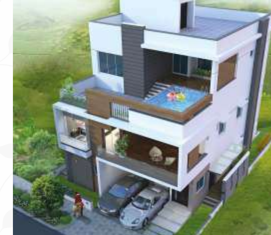
Jains Four Seasons, Kokapet.