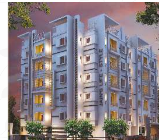
Jains PCH Lifestyle, Begumpet.