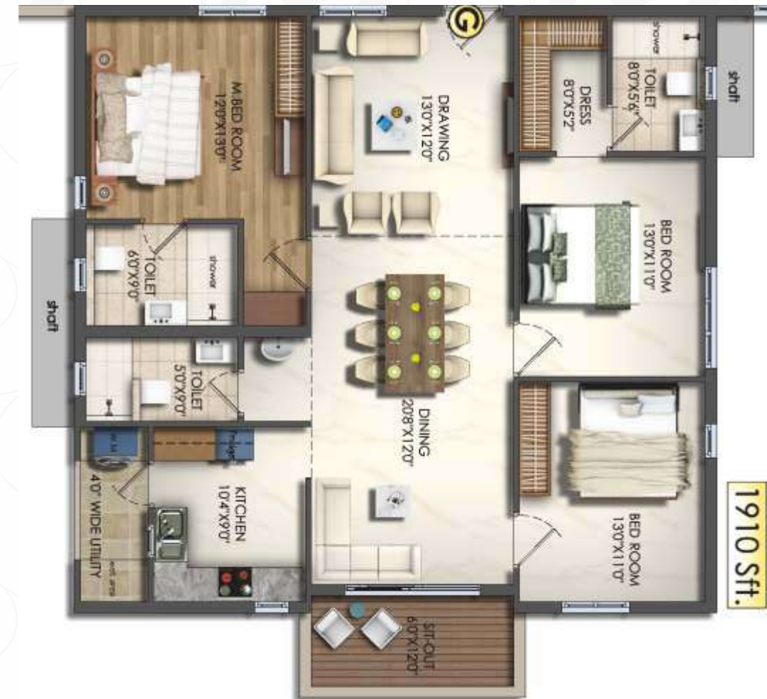
(BLOCK-B) FLOOR PLAN