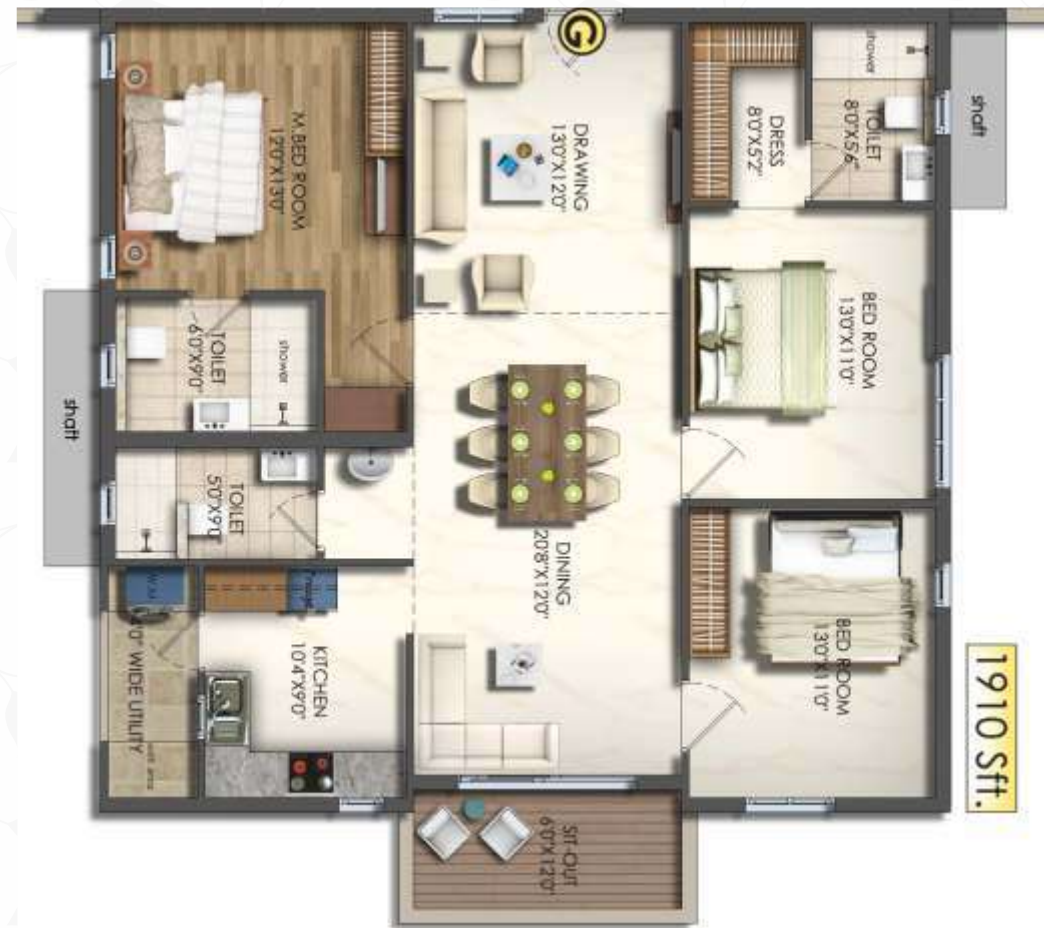
(BLOCK-A) FLOOR PLAN