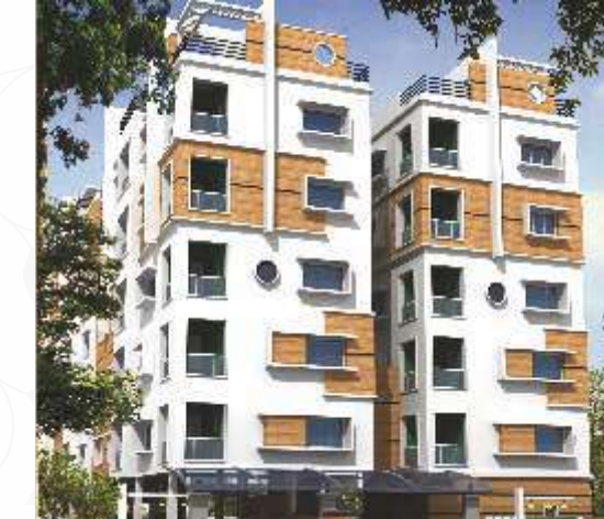
Jains PCH Elite, P.G. Road, Secunderabad.